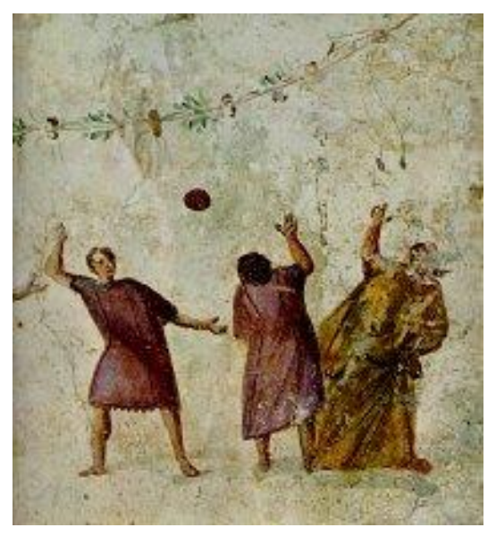
Romans playing harpustum

It is likely that some games spread through people emigrating or visiting different places and that some games developed separately. Britain was invaded so frequently between the arrival of the Romans in 43 A.D. and the Normans in 1066 that it seems likely that football-type games were brought to these shores by invaders.